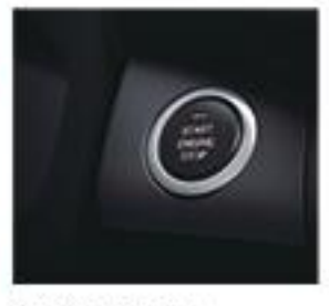
Push Start (tot AT only)