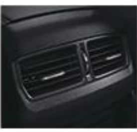
Rear Aircon Vent.