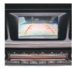
Reverse Sensor + Camera