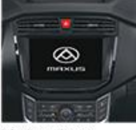
Infotainment System with Carplay + MirrorLink