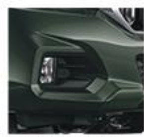
Front and Rear Foglamp