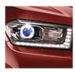
LED Headlights with Daytime Running Lights (4e4 AT anh)