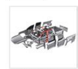
Double Layer Welding Technology