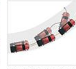
Electronic Stabilisation Program Tire Pressure Monitoring System (Not AT only)