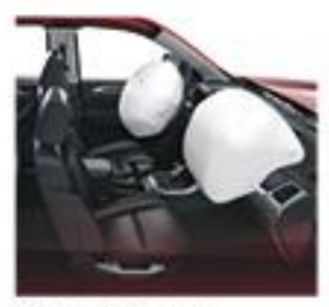
Driver and Passenger Airbags