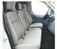
Reclining Seat (driver) with Headrest