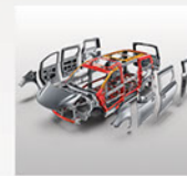
Double Layer Welding Technology