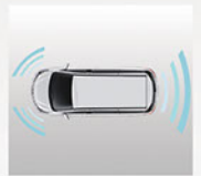
Front and Rear Parking Sensors