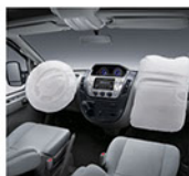
Driver and Front Passenger Airbags