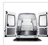
Rear Dual Swing-out Doors