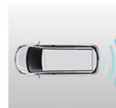
Rear Parking Sensor (Comfort only)