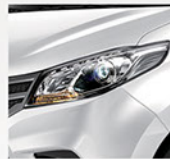
Projector Halogen Headlights