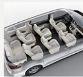
9-seat Cabin Design