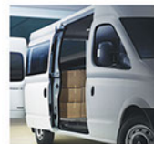
Rear Right-Hand Sliding Door