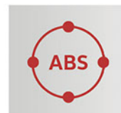
Anti-Lock Braking System