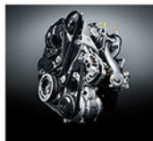
2.5L Turbo Diesel Common Rail Direct Injection