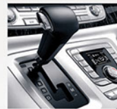
6-speed Automatic Transmission